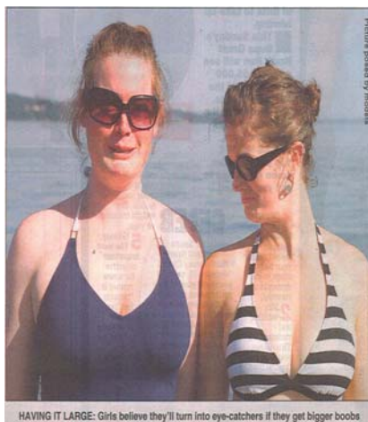
HAVING IT LARGE: Girls believe they'll turn into eye-catchers if they get bigger boobs

In The Daily Star (12 Sept), a letter is included in the Dear Jane section entitled: 'My Three Girls all want a Boob Job' in which a father explains how paying for his wife's breast implants was justified as "she needed to get her figure back... plus, of course, I'd get the benefits!" but that he doesn't want to pay for daughters' operations because: 'I don't like to think of them like that' . Within a newspaper saturated with topless images of young women, the response by Dear Jane : 'It's very shallow of your wife to believe that having big boobs will bring big rewards by attracting some guy they can live off,' promotes woman-blaming attitudes rather than recognising the role that newspapers like The Daily Star play in creating a culture in which women are valued according to the size of their breasts.